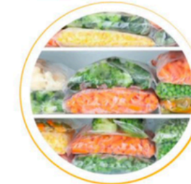
Cold chain fruits and vegetables