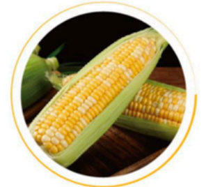
Whole grains nuts